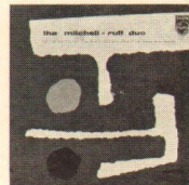
THE MITCHELL-RUFF DUO incl. My Heart Stood Still - But Beautiful 426 040 BE

all Philips records are high fidelity records!