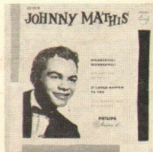
JOHNNY MATHIS incl. Wonderful! Wonderful! - It Could Happen To You 429 329 BE