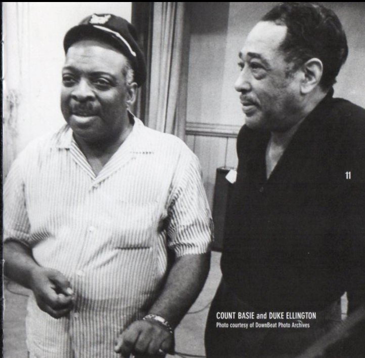
COUNT BASIE and DUKE ELLINGTON

To contact Count Basie Orchestra, call 212 977 3651 or fax 212 977 2710.