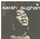
AFTER HOURS Sarah Vaughan CL 660—Extended Play B 190