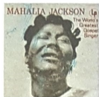
MAHALIA JACKSON The World's Greatest Gospel Singer and The Tall, Tall Tree Ensemble CL 611—Extended Play B 192, B 1995