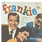
FRANKIE Frank Sinatra CL 606—Extended Play B 1081, B 1905, B 1906