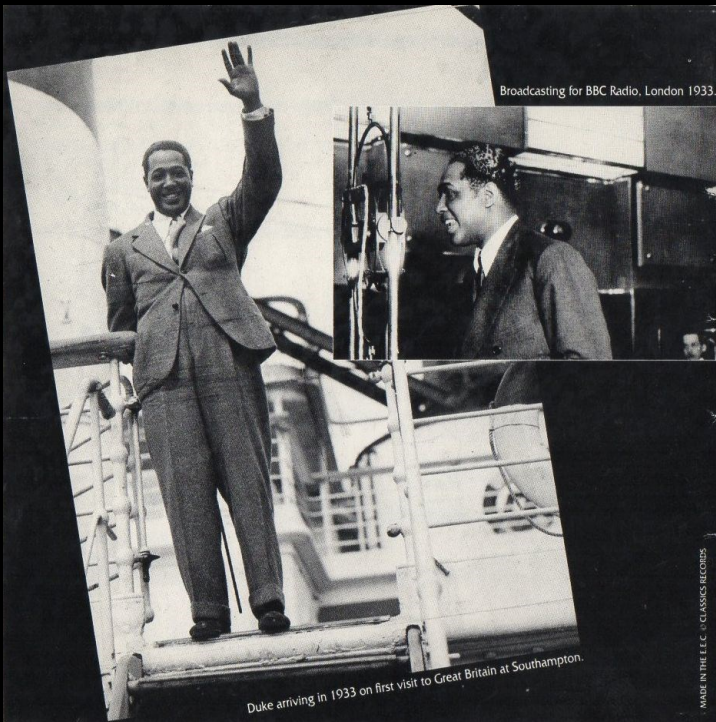
Broadcasting for BBC Radio, London 1933.