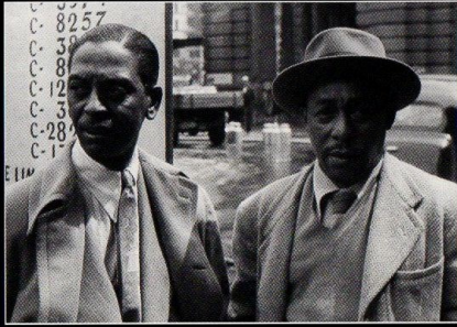
Left : Sony Greer, right : Johnny Hodges.