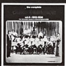
The Complete DUKE ELLINGTON Vol. 6 (1933 - 1936) CBS 88137