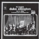
The Complete DUKE ELLINGTON Vol. 4 (1932) CBS 89035