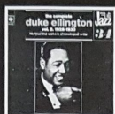
The Complete DUKE ELLINGTON Vol. 2 (1928 - 1929) CBS 88275