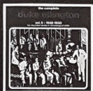
The Complete DUKE ELLINGTON Vol. 5 (1932 - 1933) CBS 89962