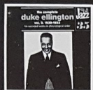
The Complete DUKE ELLINGTON Vol. 3 (1930 - 1932) CBS 88800