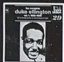
The Complete DUKE ELLINGTON Vol. 1 (1929 - 1928) CBS 87264